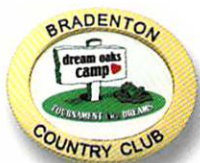
Oval 1 1/16" x 7/8" Horizontal or Vertical