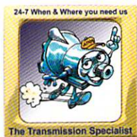
Square 1 1/16"