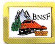
Rectangle 1 3/16" x 15/16" Horizontal or Vertical