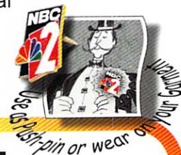
Photo Reproduction on Wide Border

With or without imprinted borders Push Pin and/or Emblematic Pin